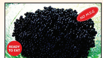
Black 12/500g Item # 30075