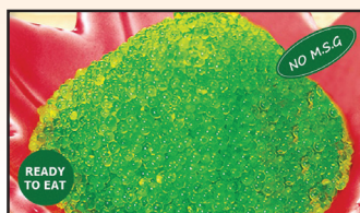
Green 12/500g Item # 30074