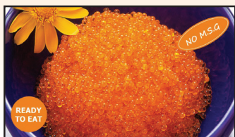
Orange 12/500g Item # 30014

It is most widely known for its use in creating certain types of sushi. The eggs are small, ranging from 0.5 to 0.8 mm. For comparison, tobiko is larger than masago, but smaller than ikura. Natural tobiko has a red-orange color, a mild smoky or salty taste, and a crunchy texture.