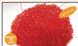
Red 12/500g Item # 30013